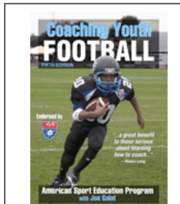
Click here for more info