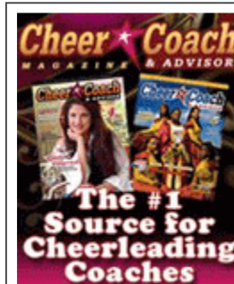
Click here to access